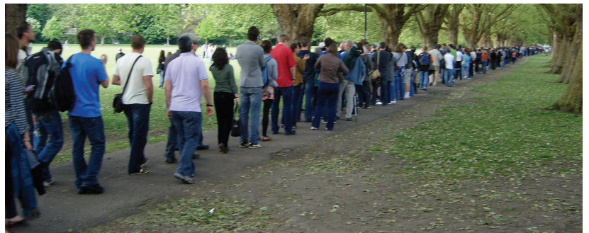
The queue for autographs stretched for miles ... !